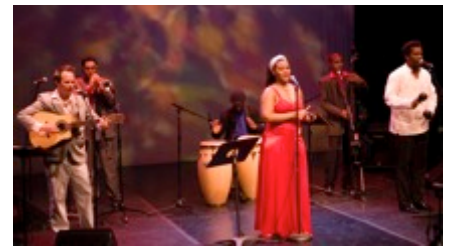
Pellejo Seco

Pellejo Seco performs as part of the Madison World Music Festival at the Willy Street Fair www.go.wisc.edu/worldmusicfest2015 900 and 1000 blocks of Williamson Street (between Paterson and Brearly)