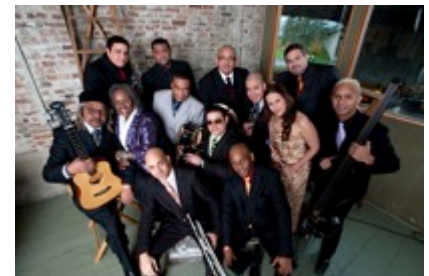
Afro-Cuban All Stars

Afro-Cuban All Stars concert www.overturecenter.org | Cost: $25-40 Overture Center | 201 State St